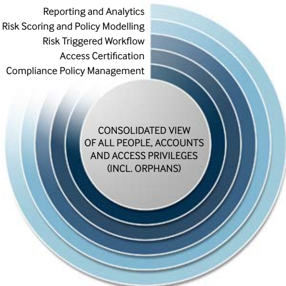
Compliance: One and IBM Tivoli Identity Manager Services for Continuous Controls Monitoring

Providing both business and technical users with a 360° view of user access, Compliance: One centralises compliance, risk scoring, audit and lifecycle management; enabling you to control and report on low-level entitlements to corporate applications, data and other resources by individuals in a unified, business-focused way.